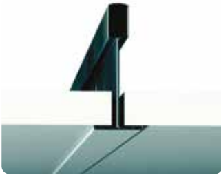
Edge A: Exposed T-15/24 grid Demountable/Pre-painted