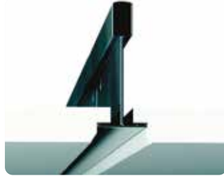
Edge E15/24: Recessed T-15/24 grid Demountable/Pre-painted