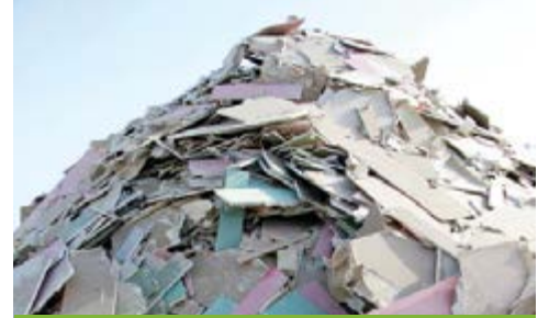
New York University, Abu Dhabi - UAE