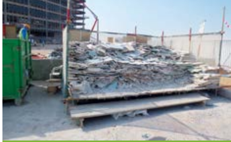
Masdar City, Abu Dhabi - UAE