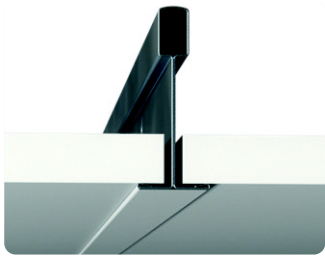
Edge A: Exposed T-15 grid, Exposed T-24 grid Demountable/Prepainted