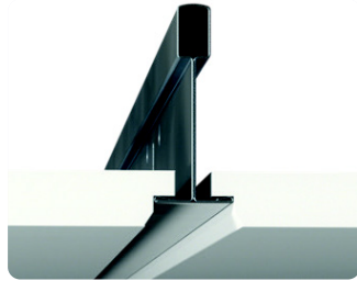
Edge E15: Exposed, recessed T-15 grid Demountable/Prepainted