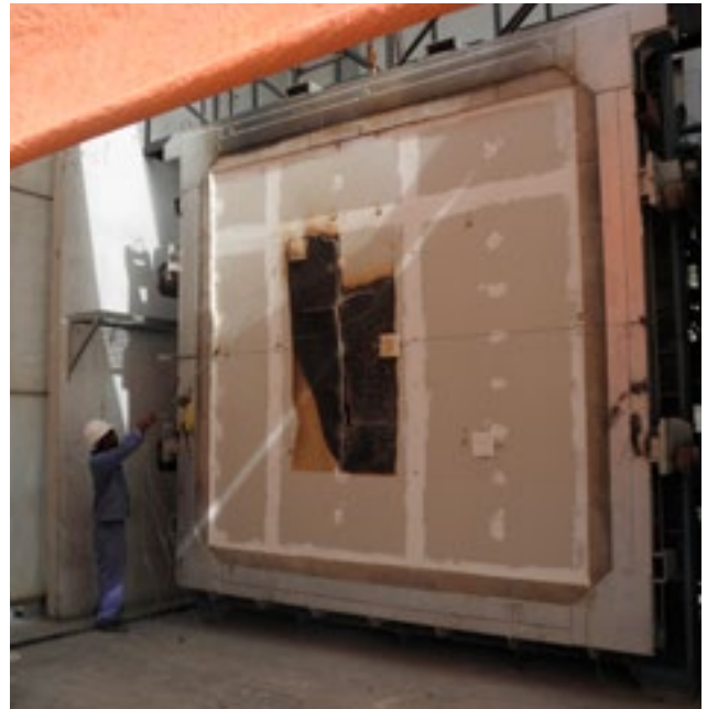
Failure of fire rated partition