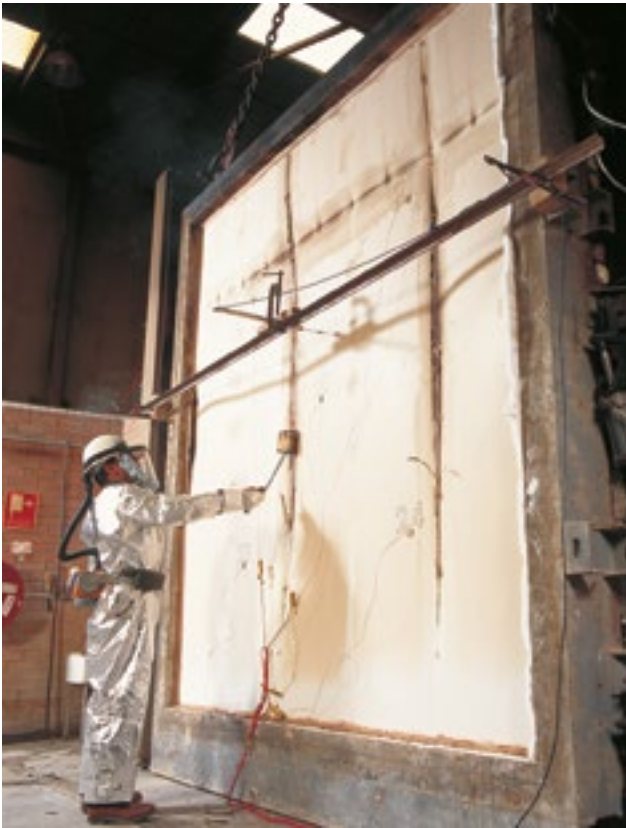
Fire resistance test – integrity testing on 3m high partition