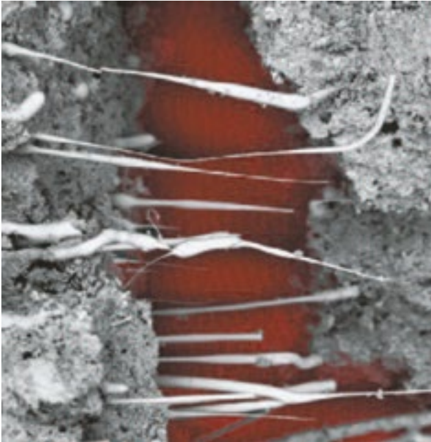
Glass fibres within the core of a Glasroc specialist board