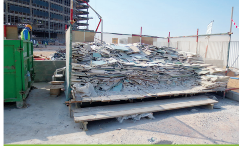
Masdar City, Abu Dhabi - UAE