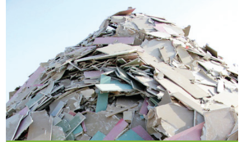
New York University, Abu Dhabi - UAE